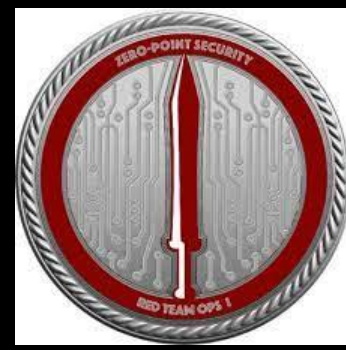
RED TEAM OPS I and II (Zero Point)