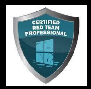
CRTP (Altered Security)