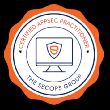
AppSec Practicioner (The SecOps Group)