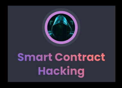
Smart Contract Hacking (smartcontractshacking. com)