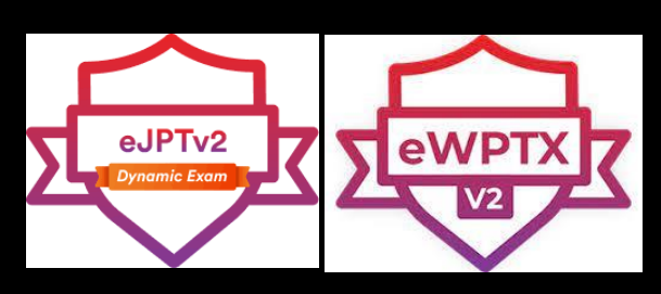
eJPTv2 and eWPTXv2 (eLearnSecurity/INE)

https://www.linkedin.com/in/joas-antonio-dos-santos/