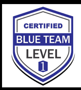
Blue Team Level 1 (Blue Team Labs)