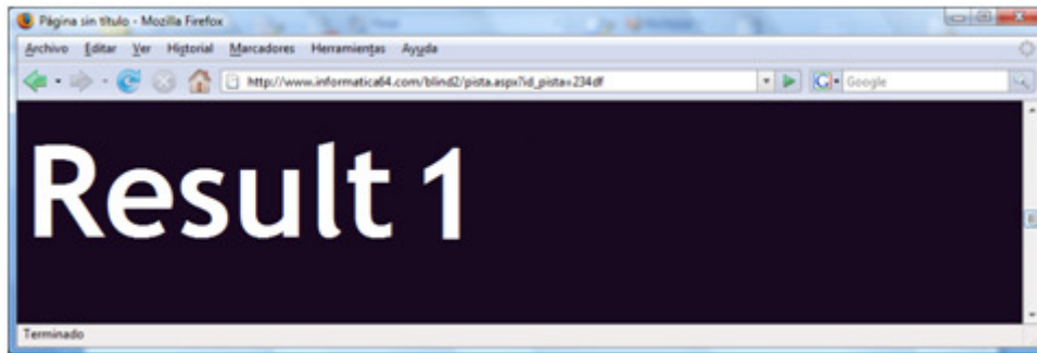
Figure 1. Error Condition. The programmer returns a default value → Result 1

In this example we have a URL with a SQL Injection vulnerability that can be exploited only by a time-based blind SQL injection. This means that there isn't any error message produced by the system (figure 2), and we always obtain the same response (sometimes because a query is right and sometimes because the programmer has coded a default response even when an error occurs).