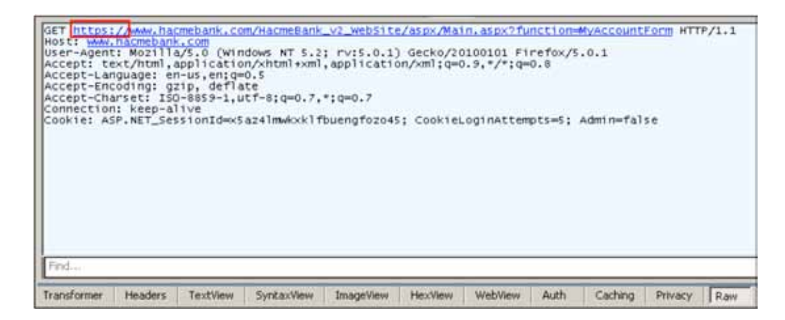
Figure 8. Figure shows the browser automatically modifies the request so that the connection attempt is made over HTTPS.

Figure 7. Figure shows the user manually trying to access a HacmeBank resource over clear text HTTP.